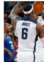
Team USA downs F