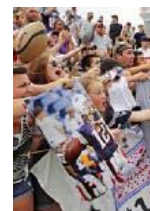
La Canfora: Bar is h